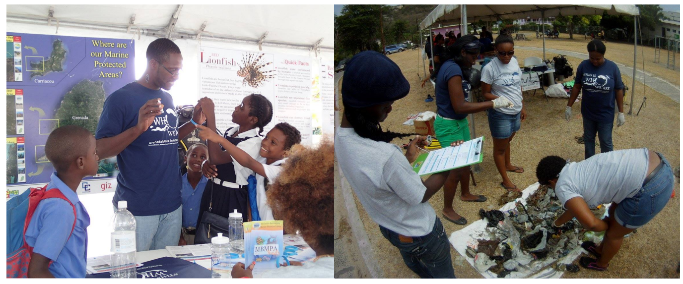
MPA Ranger at Fisherman's Birthday Celebration