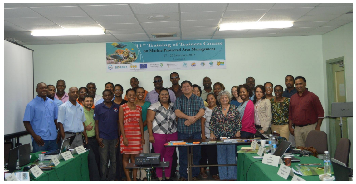
Participants of the 11<sup>th</sup> edition of the Training of Trainers on MPA Management Regional Course held in Grenada

The 11th edition of the Training of Trainers on MPA Management Regional Course, was hosted by the Grenada Fisheries Division, from 17 to 26 February, 2015. Twenty three (23) regional marine conservation professionals, including four from Grenada, participated in nine days of information sharing and best practices that could lead to more sustainable usage of marine protected areas (MPA) in their home countries. Participants was able to experience the underwater sculpture park and reef system at the Molinere Beausejour MPA which is now listed as a SPAW protected area.