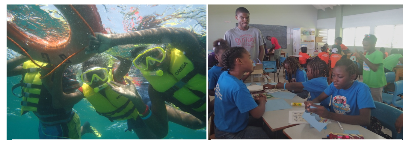
MPA Summer campers snorkeling in the Molinere-Beausejour MPA

The MPA Summer Camp 2015 was held in July 2015 at the Happy Hill Secondary School. 40 children from surrounding communities participated in activities and lectures geared towards teaching them about their environment. Activities included snorkeling, boat rides, informative lectures and art and crafts. At the end of the camp each child received a certificate recognizing their participation in the summer camp.