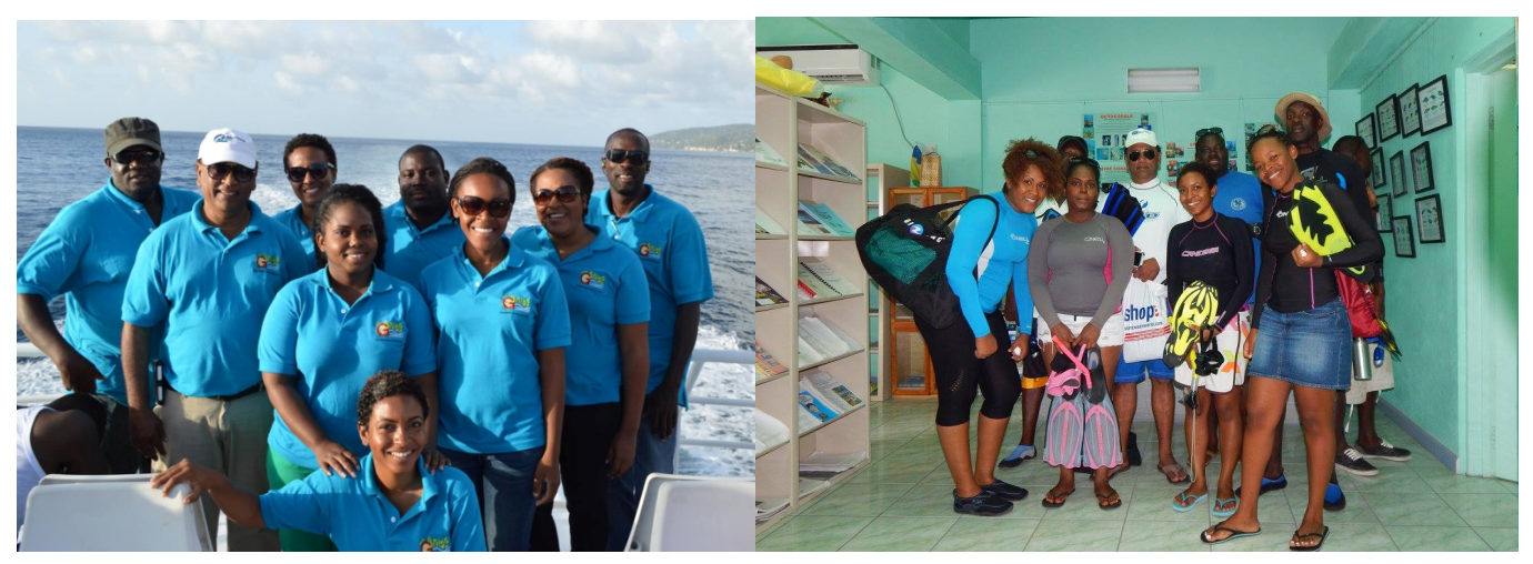
MPA team on the Osprey